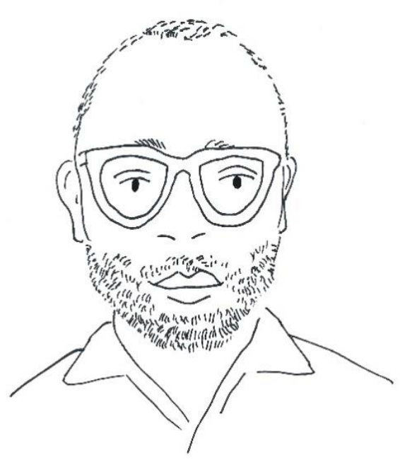
Theaster Gates, 2018 Nasher Prize Laureate

Gates's primary concern is space: "Even when I am restoring a building or making a painting, I am first considering the possibilities of space and then offering a different view." His curiosity and imagination have inspired him to explore ceramics, performance, sculpture, and transformative neighborhood projects in Chicago and around the world.